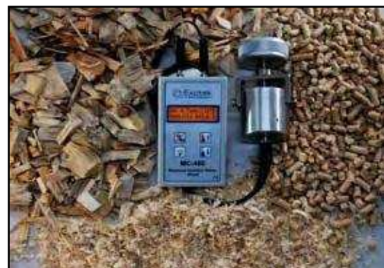
MC-460 with Compression Cup for Wood Chips, Pellet and Sawdust