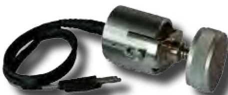
S-40 Compression cup for Wood Chips, BioFuels Pellets and Sawdust