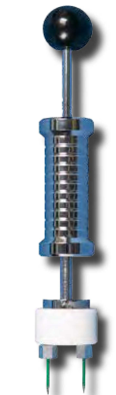
S-30 Sliding Hammer Probe for Sawn Timber and Wood